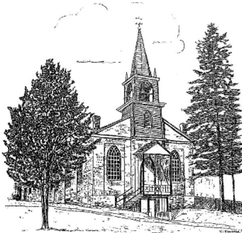
St. Andrew's Presbyterian Church Upper Melbourne, Quebec founded 1841

THE SYNOD OF QUEBEC AND EASTERN ONTARIO THE PRESBYTERIAN CHURCH IN CANADA