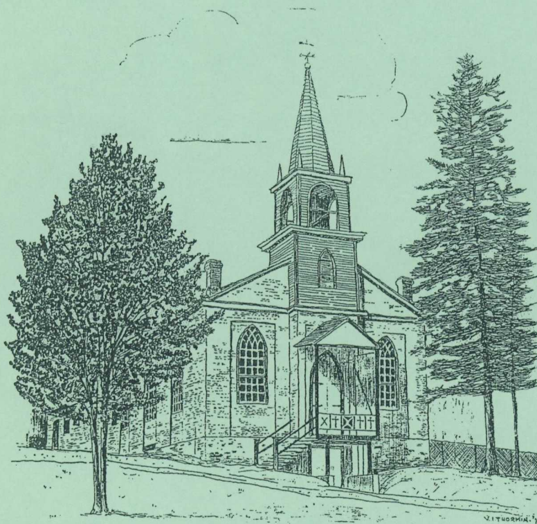
St. Andrew's Presbyterian Church Upper Melbourne, Quebec founded 1841

THE SYNOD OF QUEBEC AND EASTERN ONTARIO THE PRESBYTERIAN CHURCH IN CANADA