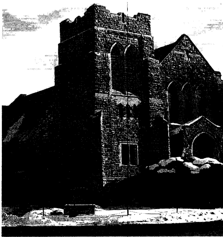
ST. ANDREW'S PRESBYTERIAN CHURCH PERTH, ONTARIO